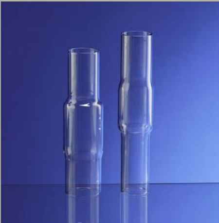
Fixed anode / glass bulbs