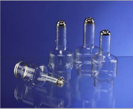
Rotating anode - glass bulbs